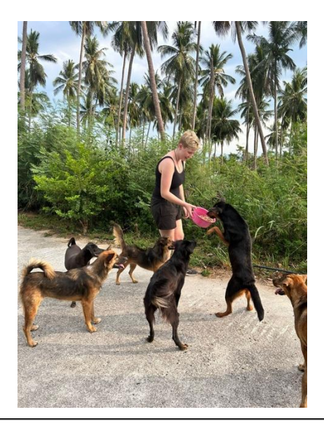
Feeding the stray dogs on the local pier and supplying them with water in Thailand

A cat spay that I performed at the Samui Dogs and Cats home before she was adopted by a family on the other side of the island (picture taken with permission)